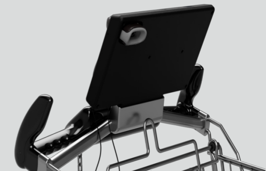
Back of the clip-on holder